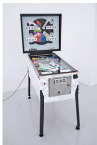
Sebastian Utzni VALUE VALUE VALUE, 2019 Pinball machine 181 x 77 x 140 cm (71-1/4 x 30-1/4 x 55 in.)