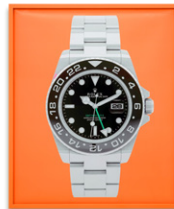
Sebastian Utzni The Rolex Series: Pablo Picasso, 2019 3-D reconstruction, digital print, Ed. 3 + 1 AP 60 x 50 cm (23-5/8 x 19-5/8 in.)