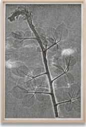
Sebastian Utzni Herbarium Turicum (Rubus armeniacus) , 2019 Nature printing, Ed. 3 + 1 AP 60 x 40 cm (23-5/8 x 15-3/4 in.)