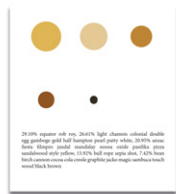
Sebastian Utzni Prediction Painting according to a Düsseldorf gallerist (Jean-Michel Basquiat, Egg, 152x102 cm, 1984), 2019 Synthetic resin enamel lacquer on Belgian linen, champagne chalk 118 x 105 cm (46-1/2 x 41-3/8 in.)