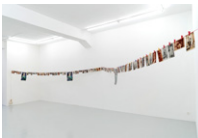
Sebastian Utzni Jeunes Arabes , 2019 Postcards, Posters, clips, rope, cotton bags with sand Size variable here: 10 meters (33 ft.)