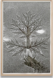
Sebastian Utzni Herbarium Turicum (Heracleum giganteum) , 2019 Nature printing, Ed. 3 + 1 AP 60 x 40 cm (23-5/8 x 15-3/4 in.)