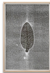
Sebastian Utzni Herbarium Turicum (Asclepias syriaca), 2019 Nature printing, Ed. 3 + 1 AP 60 x 40 cm (23-5/8 x 15-3/4 in.)