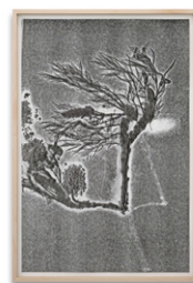
Sebastian Utzni Herbarium Turicum (Rhus Typhina), 2019 Nature printing, Ed. 3 + 1 AP 60 x 40 cm (23-5/8 x 15-3/4 in.)