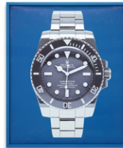
Sebastian Utzni The Rolex Series: James Bond, 2019 3-D reconstruction, digital print, Ed. 3 + 1 AP 60 x 50 cm (23-5/8 x 19-5/8 in.)