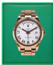
Sebastian Utzni The Rolex Series: Jay-Z, 2019 3-D reconstruction, digital print, Ed. 3 + 1 AP 60 x 50 cm (23-5/8 x 19-5/8 in.)