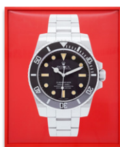
Sebastian Utzni The Rolex Series: Che Guevara, 2019 3-D reconstruction, digital print, Ed. 3 + 1 AP 60 x 50 cm (23-5/8 x 19-5/8 in.)