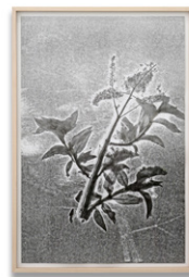
Sebastian Utzni Herbarium Turicum (Buddleja davidii), 2019 Nature printing, Ed. 3 + 1 AP 60 x 40 cm (23-5/8 x 15-3/4 in.)