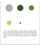
Sebastian Utzni Prediction Painting according to an Art Advisor (Njideka Akunyili Crosby, "The Beautiful Ones" Series #2, 155x106 cm, 2013) , 2019 Synthetic resin enamel lacquer on Belgian linen, champagne chalk 118 x 105 cm (46-1/2 x 41-3/8 in.)