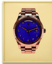
Sebastian Utzni The Rolex Series: Dalai Lama, 2019 3-D reconstruction, digital print, Ed. 3 + 1 AP 60 x 50 cm (23-5/8 x 19-5/8 in.)