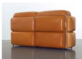
wiedemann/mettler Order 1 , 2007 Goatskin leather upholstered, chromium plated system 90 x 55 x 170 cm (35-1/2 x 21-1/2 x 67 in.) wm207.01