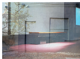
wiedemann/mettler America 1 , 2017 Lambda-Print, Ed. 1/3 120 x 160 cm (47-1/4 x 63 in.) wm217.05