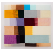
wiedemann/mettler Coloured Recollections 3 , 2017 Cotton velvet pieces treated with Javel water, upholstered 130 x 118 x 10 cm (51-1/8 x 46-1/2 x 4 in.) wm217.03