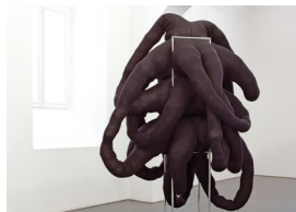
wiedemann/mettler bleak outlook , 2008 Stuffed Leggins, chromium plated system 214 x 100 x 100 cm (84-1/4 x 39-3/8 x 39-3/8 in.) wm208.01