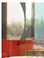
wiedemann/mettler America 2 , 2017 Lambda-Print, Ed. 1/3 160 x 120 cm (63 x 47-1/4 in.) wm217.06