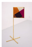
wiedemann/mettler Mercy 2 , 2017 Herrmès foulard, gold-galvanized chromium plated system 110 x 35 x 35 cm (43-1/4 x 13-3/4 x 13-3/4 in.) wm217.04