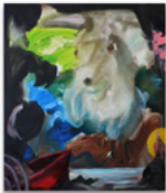
Klodin Erb Dog's Heaven , 2018 Acrylic and oil on canvas 70 x 60 cm (27-1/2 x 23-5/8 in.)