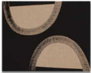
Michael Bauch Untitled , 2013 Acrylic on canvas 40 x 50 cm (15-3/4 x 19-5/8 in.)