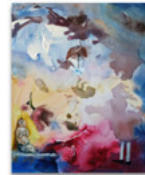
Klodin Erb Every Sailor's Dream , 2018 Acrylic and oil on canvas 42 x 35 cm (16-1/2 x 13-3/4 in.)