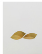
Mamiko Otsubo Untitled (Brass squint extruded) , 2017 Metallic film on mylar 35.6 x 27.9 cm (14 x 11 in.)