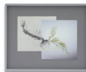
Franziska Furter Shape / Pali , 2014 Collage 27 x 33.5 cm (10-5/8 x 13-1/4 in.)