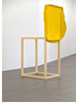
Anna Amadio Vincent van Gogh, Les tournesols - The closest I could get , 2017 Acrylic. mixed media, wood 106 x 102 x 7 cm (41-3/4 x 40 x 3 in.)