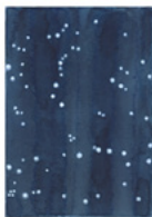
Slawomir Elsner Dragon (From the A4 Series Sheet 87) , 2014 Watercolour on paper 29.7 x 21 cm (11-5/8 x 8-1/4 in.)