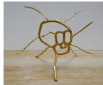
Bill Woodrow Self-portrait in the Year 2085 , 2010 Bronze, gold leaf, unique 28 x 39 x 34 cm (11 x 15-3/8 x 13-3/8 in.)