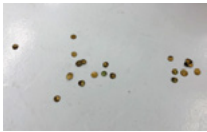
Benedikte Bjerre Untitled (Coins) , 2018 Squashed Coins 40 x 72 x 84 cm (15-3/4 x 28 x 33 in.)