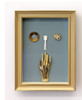
Gitte Schäfer Ohhh , 2013 Linen, metal, mother of pearl, shell 32 x 24.5 x 7.8 cm (12-1/2 x 9-5/8 x 3 in.)