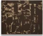
Pierre Haubensak Ohne Titel , 2018 Acrylic on burlap 90 x 110 cm (35-1/2 x 43-1/4 in.)