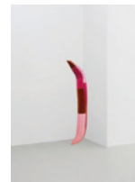
wiedemann/mettler Zurich , 2018 Velvet cotton filled with polyethyl granulat 153 x 16 x 16 cm (60 x 6-1/4 x 6-1/4 in.)