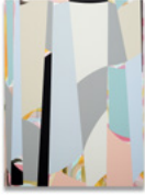
Clare Goodwin Whispering Widows (Clive + Beverly) , 2018 Acrylic/acrylic ink on canvas 190 x 140 cm (74-3/4 x 55-1/8 in.)