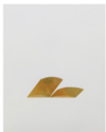
Mamiko Otsubo Untitled (Brass eyes halved) , 2017 Metallic film on mylar 35.6 x 27.9 cm (14 x 11 in.)