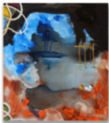
Klodin Erb Schau nie einem Nashorn in die Augen , 2018 Acrylic and oil on canvas 84 x 76 cm (33-1/8 x 29-7/8 in.)