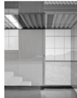
wiedemann/mettler Faraglioni , 2018 Lambda print, Ed. 3 50 x 40 cm (19-5/8 x 15-3/4 in.)