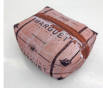
Benedikte Bjerre Goods (Champagne) , 2018 Sewn printed fabric filled with foam 40 x 72 x 84 cm (15-3/4 x 28 x 33 in.)