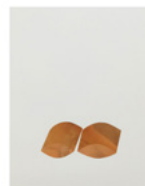
Mamiko Otsubo Untitled (Copper eyes extruded) , 2017 Metallic film on mylar 35.6 x 27.9 cm (14 x 11 in.)