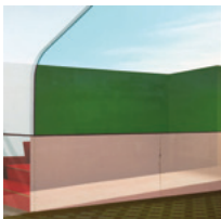
wiedemann/mettler Imperial , 2018 Lambda print, Ed. 3 40 x 40 cm (15-3/4 x 15-3/4 in.)