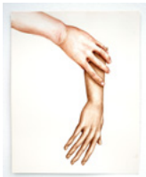
Jamie Isenstein Untitled (Hand Holding Mannequin Arm Down) , 2018 Watercolor and pencil on paper 35.2 x 28 cm (13-7/8 x 11 in.)