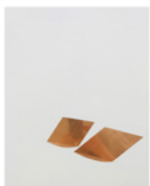
Mamiko Otsubo Untitled (Copper eyes halved and flipped) , 2017 Metallic film on mylar 35.6 x 27.9 cm (14 x 11 in.)