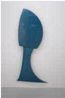
Alexander Heim Anglo-Saxon Bonnet No. 2 , 2012 Found metal car part, split in two pieces 250 x 110 x 12 cm (98-1/2 x 43-1/4 x 4-3/4 in.)