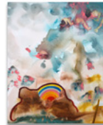
Klodin Erb A picky Bird , 2018 Acrylic and oil on canvas 59 x 50 cm (23-1/4 x 19-5/8 in.)