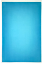
Slawomir Elsner From the Series Just Watercolors (029) , 2017 Watercolour on paper 168 x 110 cm (66-1/8 x 43-1/4 in.)