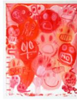
Anne-Lise Coste Les Migrants 3 , 2016 Oil on canvas 210 x 168 cm (82-5/8 x 66 in.)