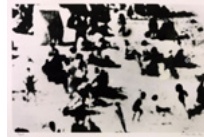
Richard Hamilton People , 1968 65 x 84 cm (25-1/2 x 33 in.)