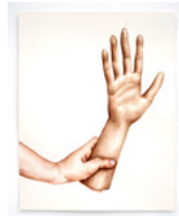
Jamie Isenstein Untitled (Hand Holding Mannequin Arm Up) , 2018 Watercolor and pencil on paper 35.2 x 28 cm (13-7/8 x 11 in.)