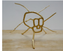
Bill Woodrow Self-portrait in the Year 2085 , 2010 Bronze, gold leaf, unique 28 x 39 x 34 cm (11 x 15-3/8 x 13-3/8 in.)