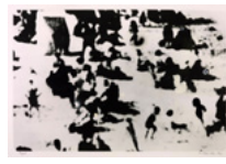
Richard Hamilton People , 1968 Photograph, Screenprint from 4 stencils, retouched by hand, Ed. 26 + 1 AP 65 x 84 cm (25-1/2 x 33 in.)