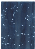
Slawomir Elsner Dragon (From the A4 Series Sheet 87) , 2014 Watercolour on paper 29.7 x 21 cm (11-5/8 x 8-1/4 in.)