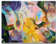
Klodin Erb Big Trip , 2018 Acrylic and oil on canvas 70 x 90 cm (27-1/2 x 35-3/8 in.)