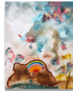
Klodin Erb A picky Bird , 2018 Acrylic and oil on canvas 60 x 50 cm ( 23-5/8 x 19-5/8 in.)