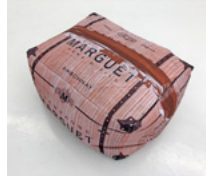
Benedikte Bjerre Goods (Champagne) , 2018 Sewn printed fabric filled with foam 40 x 72 x 84 cm (15-3/4 x 28 x 33 in.)