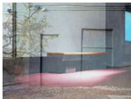
wiedemann/mettler America 1 , 2017 Lambda-Print, Ed. 1/3 120 x 160 cm (47-1/4 x 63 in.) wm217.05