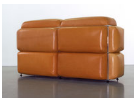
wiedemann/mettler Order 1 , 2007 Goatskin leather upholstered, chromium plated system 90 x 55 x 170 cm (35-1/2 x 21-1/2 x 67 in.) wm207.01