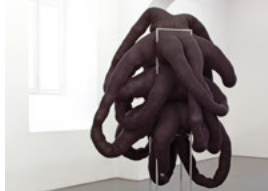
wiedemann/mettler bleak outlook , 2008 Stuffed Leggins, chromium plated system 214 x 100 x 100 cm (84-1/4 x 39-3/8 x 39-3/8 in.) wm208.01