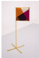
wiedemann/mettler Mercy 2 , 2017 Herrmès foulard, chromium plated system 110 x 35 x 35 cm (43-1/4 x 13-3/4 x 13-3/4 in.) wm217.04