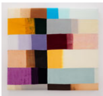
wiedemann/mettler Coloured Recollections 3 , 2017 Cotton velvet pieces treated with Javel water, upholstered 130 x 118 x 10 cm (51-1/8 x 46-1/2 x 4 in.) wm217.03