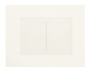
Fred Sandback Etching on Zinc , 1975 Etching on zinc plate, Artist Proof Edition: 50 + 10 + 10 Blatt: 50.5 x 60.5 cm; Bild: 29.8 x 39.2 cm (Sheet: 19-7/8 x 23-3/4 in.; Image: 11-3/4 x 15-1/2 in.)