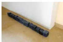
Katinka Bock Kalender (klein) , 2011 Ceramic, enamelled 13 emailierte Keramikwürfel, je etwa 12 x 12 x 12 cm (13 enameled ceramic cubes, each around 4-3/4 x 4-3/4 x 4-3/4 in.)