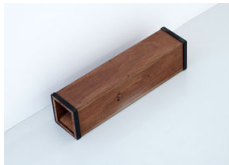
Andreas Slominski Wieselwippbrettfalle , 1989 Wood, metal 15 x 50 x 12 cm (6 x 19-5/8 x 4-3/4 in.)