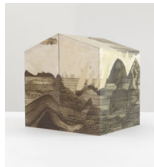
Sandra Vásquez de la Horra Fata Morgana , 2019 Tridimensional drawing, pencil and wax on paper 36 x 30 x 36 cm (14-1/8 x 12 x 14-1/8 in.)