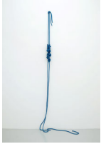
Franziska Furter Trap/Cepo , 2018 Nylon rope 246 x 76 x 33 cm (97 x 30 x 13 in.)