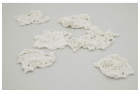
Franziska Furter Storms/Caad-Leru-Evr-Üül-Wingu-Ilifu , 2018 Knotted nylon ropes, in 6 parts je ca. 15 x 64 x 45 cm (each approx. 6 x 25 x 17-3/4 in.)