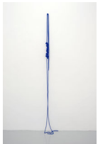
Franziska Furter Trap/Bay , 2018 Nylon rope 234 x 27 x 22 cm (92 x 10-1/2 x 8-5/8 in.)