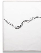
Franziska Furter Refractions/Tonn , 2018 Ink on paper 125 x 99 cm (49-1/4 x 39 in.)