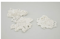
Franziska Furter Storms/Milpirri-Bulut-Mrok , 2018 Knotted nylon ropes, in 3 parts je ca. 15 x 64 x 45 cm (each approx. 6 x 25 x 17-3/4 in.)