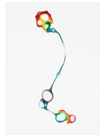
Franziska Furter Scattered Rainbow/Katumbiri , 2014 Ink on paper 32 x 24 cm (12-5/8 x 9-1/2 in.)