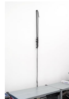
Franziska Furter Trap/Phand , 2018 Nylon rope 204 x 7 x 5 cm (80 x 3 x 2 in.)