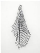
Franziska Furter Waveland/Ruitenet , 2018 Plastic beads, nylon 75 x 33 x 15 cm (29-1/2 x 13 x 6 in.)