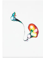
Franziska Furter Scattered Rainbow/Indreni , 2014 Ink on paper 32 x 24 cm (12-5/8 x 9-1/2 in.)